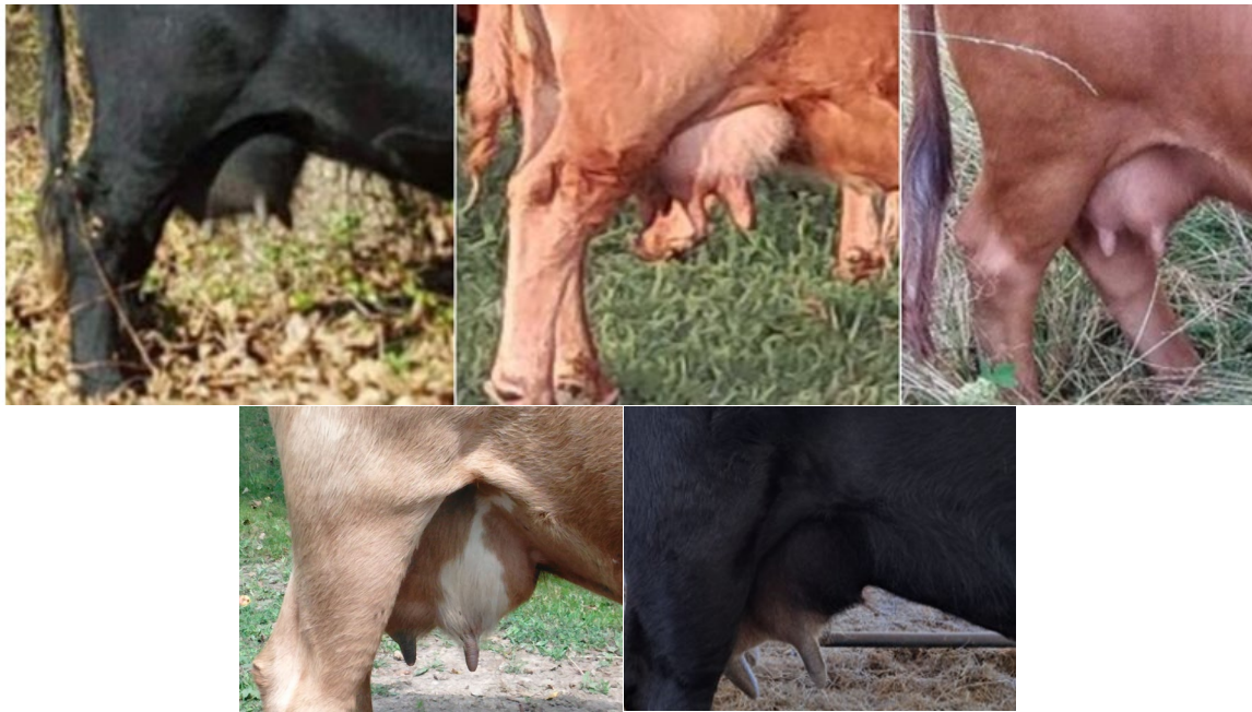
Figure 6. Bottom Tier Fore Udder Attachment (classification 1 - 3)

For udder attachments that score at the bottom tier, 1 through 3, indicate a degree of structural failure that generally disqualifies an animal from a registered seedstock program. These udders are visibly detached from the abdominal wall, often sharply cut-up or pocketed, and lack the supportive ligaments and musculature needed for functional longevity.