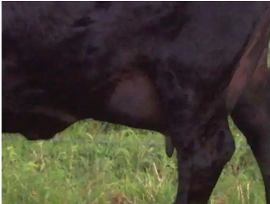
Figure 1. Ideal Fore Udder Attachment

The udder in Figure 1 is from a 4th-lactation Dexter cow and represents the ideal fore udder attachment. A smooth, seamless transition, well forward, into the abdominal wall – welded on. 1