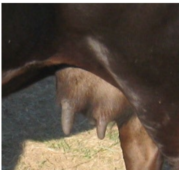
Figure 2. Very Poor Fore Udder Attachment

Fore udder attachment is a moderately heritable trait, with estimates ranging from 0.23 to 0.28 across large-scale studies in both dairy and dual-purpose breeds (Němcová et al., 2011; Gibson & Dechow, 2018; Körösi et al., 2025). While moderate heritability does not allow for rapid improvement, it does confirm that targeted selection produces genetic progress across generations.